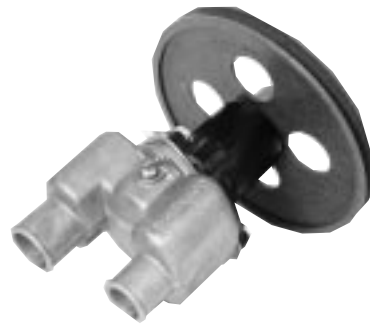
G9901 & G9903