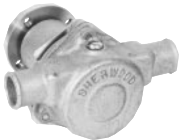
K75 & K75B