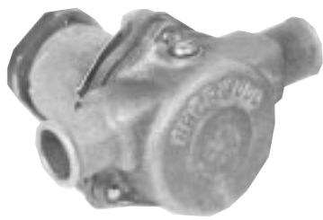
G30-2 & G30-2B