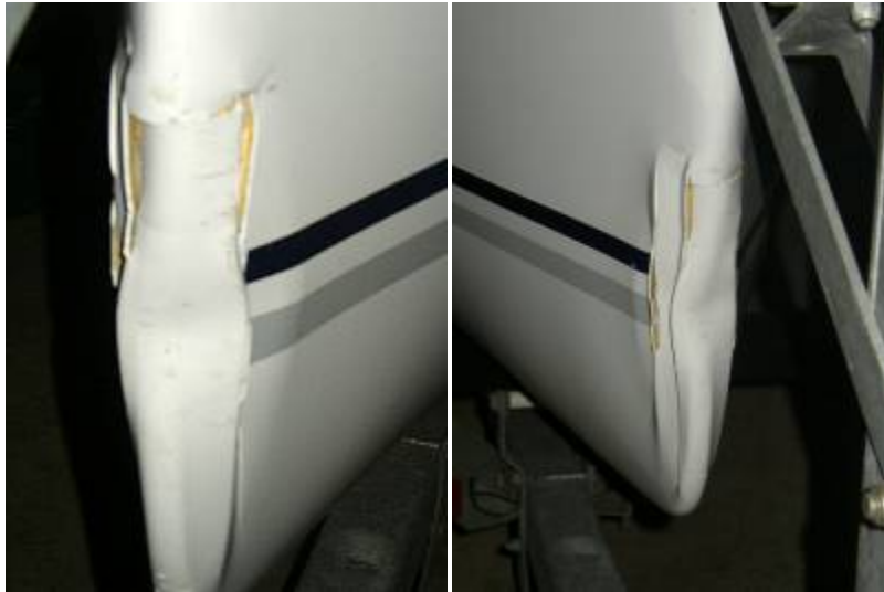
Hard hit on dock