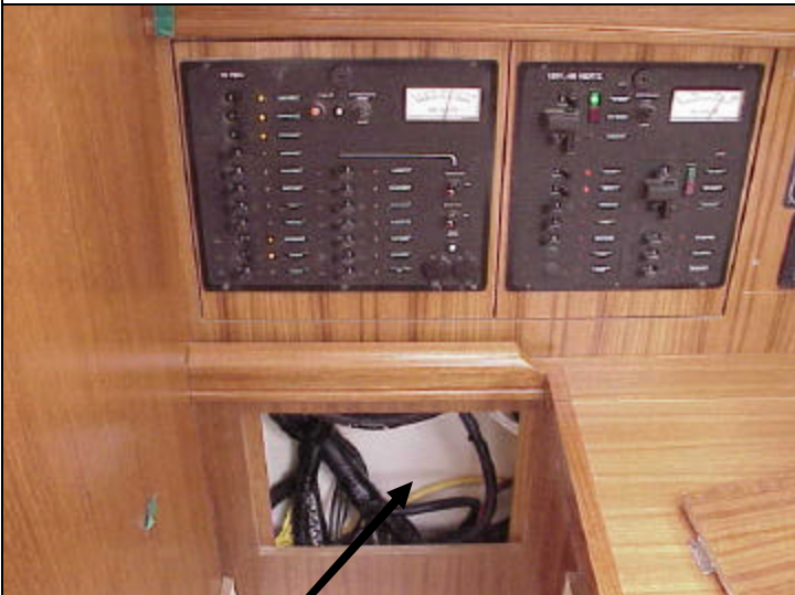
Photo of the compass computer after the face has been removed from the forward end of the nav station.

The auto pilot wires should be in the harness under the AC & DC panels. They will have the same numbers, wire size, & color as the wires in the back.