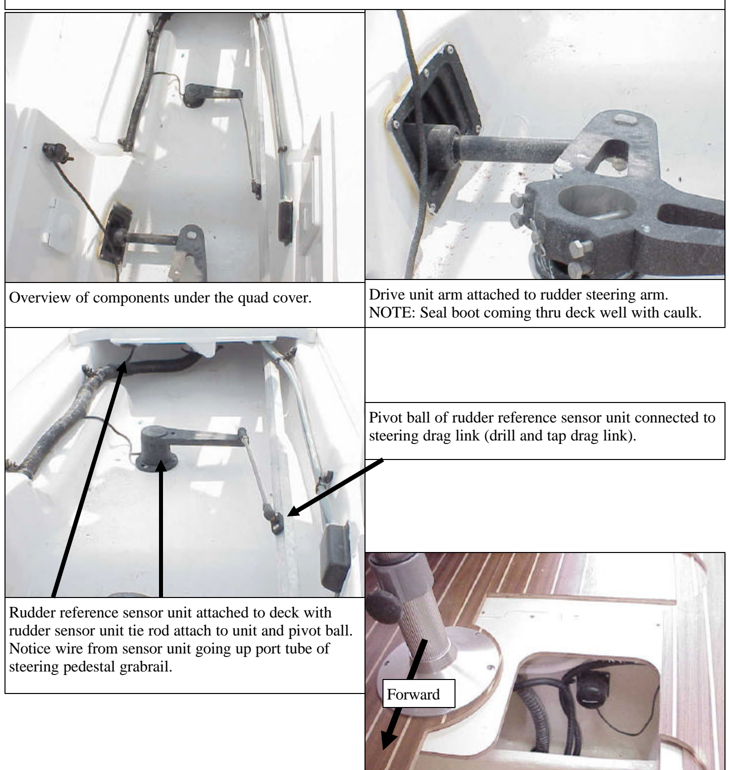
Fluxgate compass will be located in the forward keel compartment.