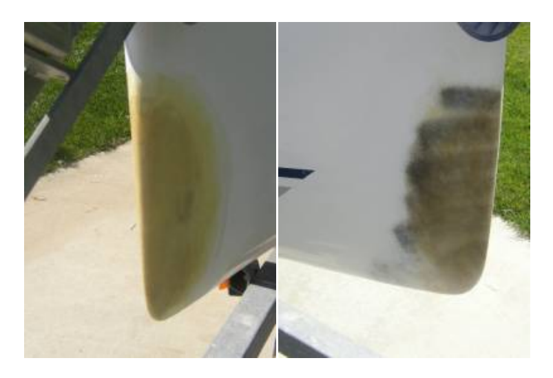
A finish coat of plexus id applied and a light guide coat is used to make sure repair is smooth and sand scratches are removed